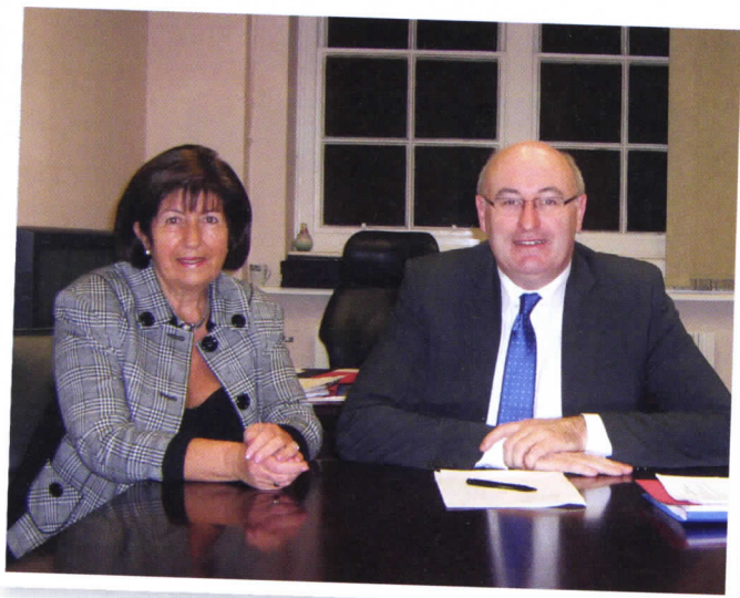
Minister for the Environment, Phil Hogan TD met with Cllr Edie Wynne to discuss the Rathmines/Pembroke sewerage scheme and the Swan River.

The Brief for the Scheme will be quite broad in nature and will require examination of flooding in the catchment area, in addition to the normal environmental and structural deficiencies that may exist in the system.