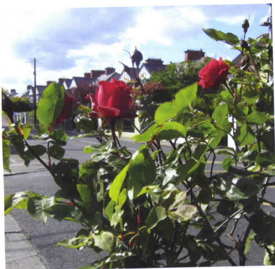
Terenure Road West prepares for the Dublin City Neighbourhood Awards 2013